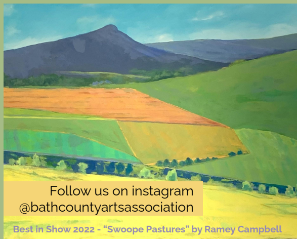
Follow us on Instagram @bathcountyartsassociation

Should you wish to pay by check, you may deliver payment at drop-off. Lastly, all prize money will be mailed to winners this year INSTEAD of pickup on the last day of the show.